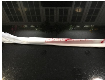
5. Fold bag back in half one more time