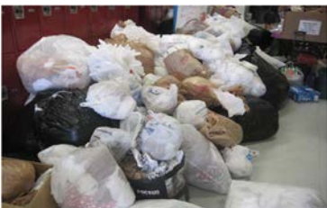
Our first mat project starting point.

Here are a few pictures of past projects. Take a look at a possible future project using plarn to make water bottle carriers!