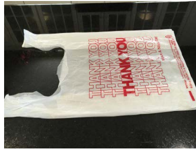
2. Flatten bag (back to original shape)