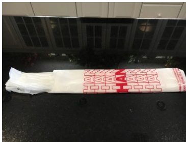
4. Fold bag in half again