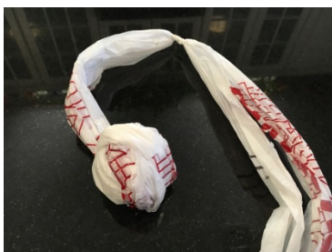
10. Roll the strand into a ball called "Plarn"