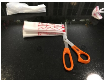
7. Cut folded bag in half