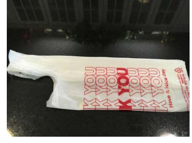
3. Fold in half, lengthwise