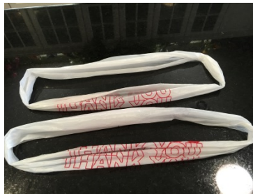
8. Unfold the two pieces creating two loops