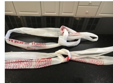
9. Knot both loops together to form a single strand