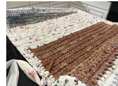
12. A sleeping mat nearing completion!