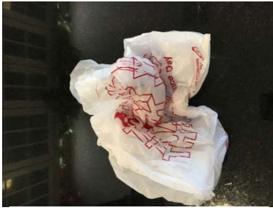
1. Start recycling project with plastic bag