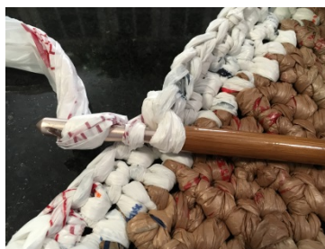
11. Crochet as you would with yarn