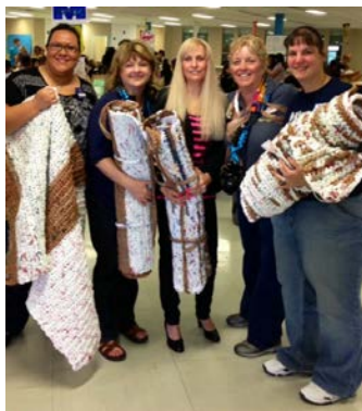
Completed mats presented to Street Teens at past K-1 Day.