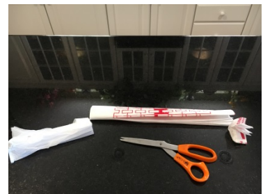
6. Cut off both ends, discard the handles & bottom